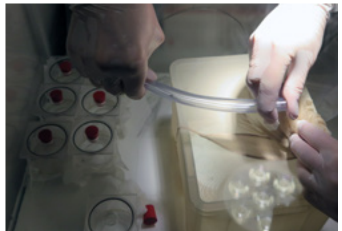
Secure handling of a mosquito

...blood! For this clinical trial, we complemented our excellent proderm team with some new colleagues: tiny, blood-sucking insects! In cooperation with a specialized provider of laboratory-grade mosquitos, we developed and implemented a system to reliably induce single mosquito bites on the volar forearms of human volunteers.