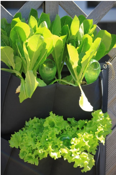
Some results of the Urban Gardening Project